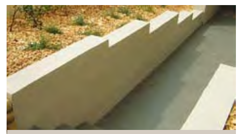
Hebel BRAACE™ retaining wall