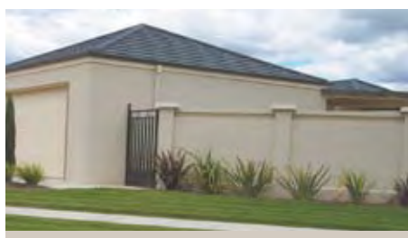
Hebel SoundFence™ fencing