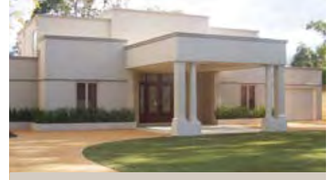
Hebel PowerWall™ external wall